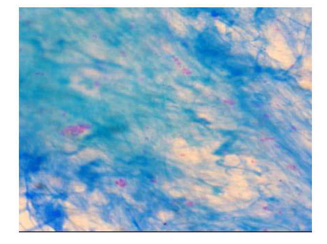
Figure 3 Sputum showing positivity of acid-fast bacilli

The case that we report could be confused by coincidental presentation of adult idiopathic thrombocytopenic purpura and tuberculosis, by drug-induced thrombocytopenia, thrombotic thrombocytopenic purpura (TTP)-hemolytic uremic syndrome (HUS), hemophagocytic syndrome and disseminated intravascular coagulation (DIC) associated with TB. Idiopathic thrombocytopenic purpura (ITP, also known as primary immune thrombocytopenic purpura) is an acquired disease of children and adults defined as isolated thrombocytopenia with no clinically apparent associated conditions or other causes of throm-