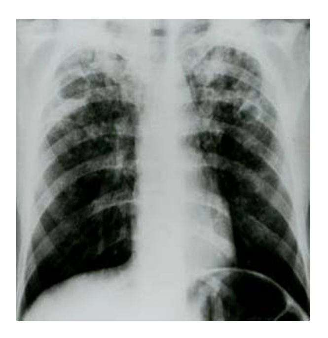
Figure 1 Anteroposterior chest radiograph showing cavitary lesions in both lungs